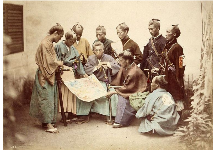
Japanese Samurai, 1860s